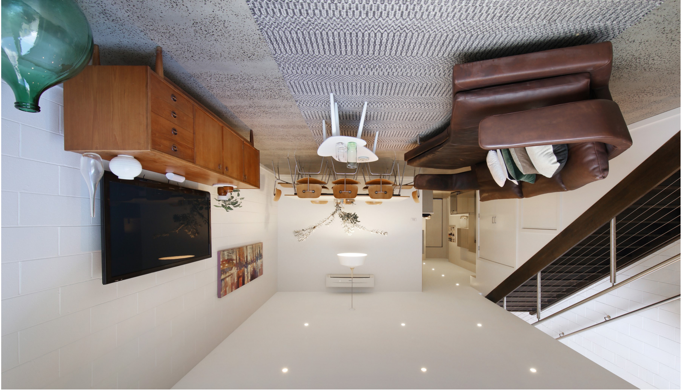
34 Staunton Lane, Glen Iris